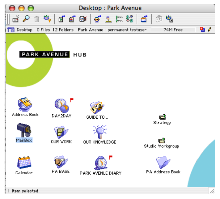
Park Avenue's FirstClass Desktop

Park Avenue had considered implementing Microsoft Exchange because their parent organisation is PC oriented and their preferred choice was Microsoft Exchange. However, because of the high Mac usage within the agency, Park Avenue was not convinced that the Microsoft technology would provide the necessary functionality they required. Instead they selected FirstClass from Open Text.