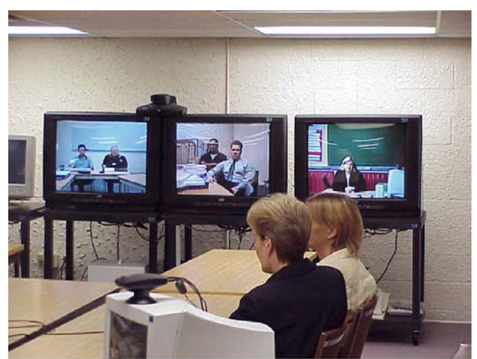
Education Services Centre - First Class Inservice