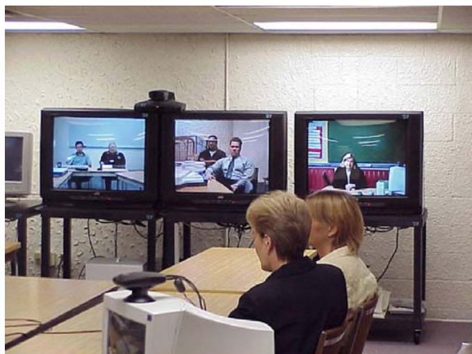
Education Services Centre - First Class Inservice